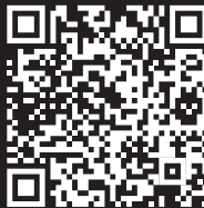
pH 4.5-9 Z050F